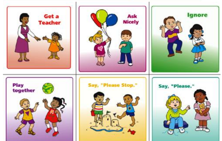
3 X 3 SOLUTION KIT CUE CARDS