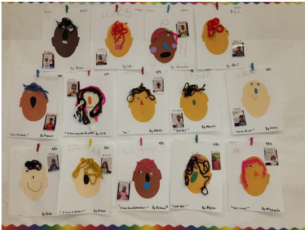
Students created Self-Portraits- Expressing how happy they are to be in school!